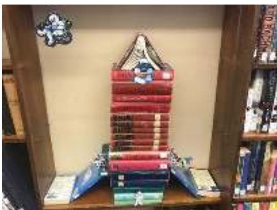
A rocket display at the C.B. Preston Memorial Library in Orleans.