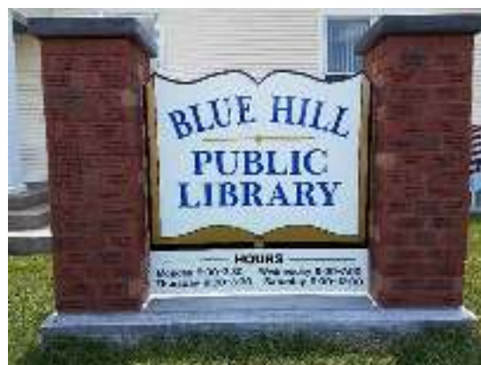
Blue Hill Public Library has a new sign in front of the Library!