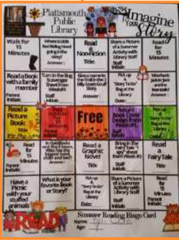
Tali's Winning Bingo Card

Bingo cards were a part of the bags with all kinds of fun activities for the kids to complete to receive prizes. Each single bingo received a snack as a small prize right then. Once they reached five bingos, they are entered into a drawing for the large prizes, which will be given away on August 1st