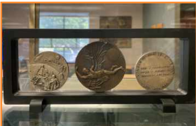
Apollo 11 coins