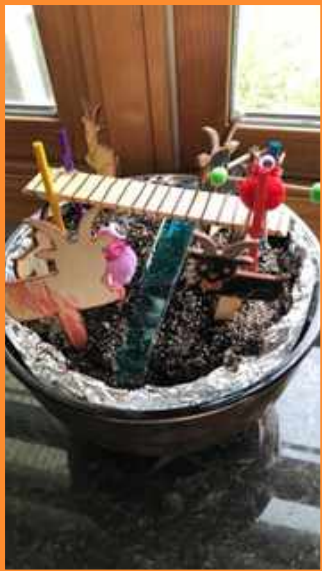
Clark & Owen made this scene using our library laser cut goats plus their own props.