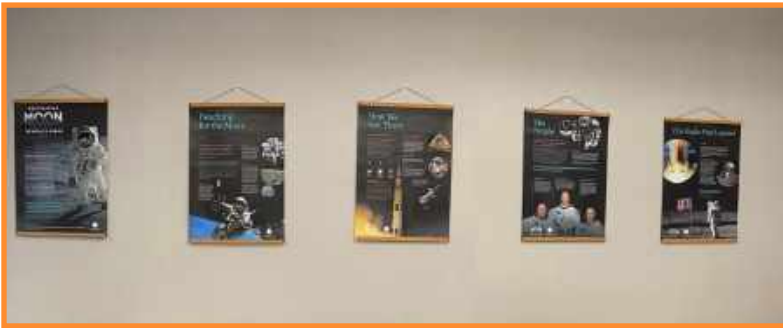
Apollo 11 posters

To see more from us here at BU, check out Facebook page and watch for upcoming events here .