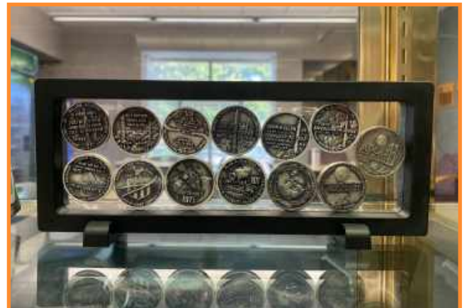
Apollo 11 coins