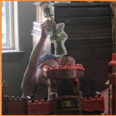
Miah's puppet, Jack, climbing the castle to meet the giant.

The Plattsmouth Public Library's "Story to Go" bags wrapped up on Tuesday (30 June 2020) with "The Three Little Pigs" as the last story to be featured. There was a tremendous response from the families for the fun activity bags that we have been handing out to kids ages 0-12. We gave away approximately 575 bags since the first week in June.