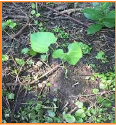
Skyliee and Apollo's plant outside after outgrowing the original cup.