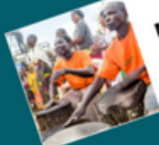
Music From Around the World Humanities Nebraska