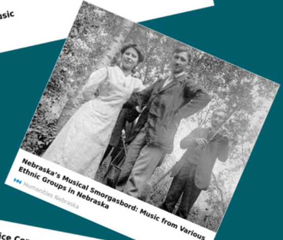
Nebraska's Musical Smorgasbord: Music from Various Ethnic Groups in Nebraska Humanities Nebraska