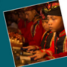
Encounters with World Music Humanities Nebraska