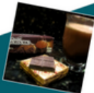
How Chocolate Twice Conquered the American Continent: A Deliciously Historical Perspective Humanities Nebraska