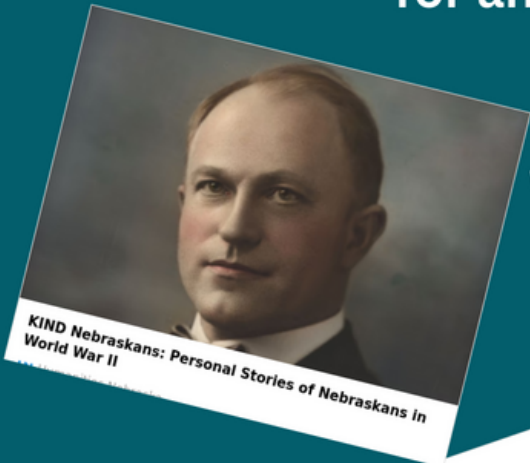
KIND Nebraskans: Personal Stories of Nebraskans in World War II

Explore https://humanitiesnebraska.org/ for an interesting speaker